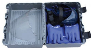
1 | Cryogenic Safety Equipment