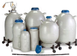
2 | Additionnal dewars